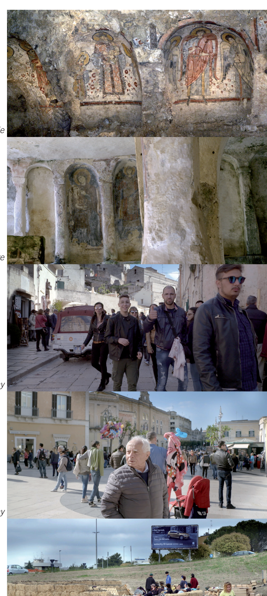
Cripta del Peccato Originale